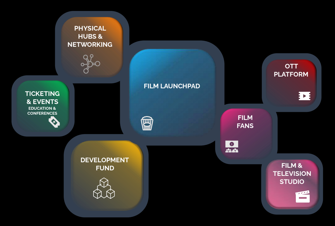
The FILM Token Platform

Key to the success of the platform is ensuring that it covers the full spectrum of the creative lifecycle process.