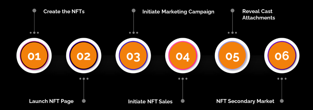
Example Roadmap for Fortune NFT's

An example of how a FILM Token Fortune NFT could be used is illustrated below.