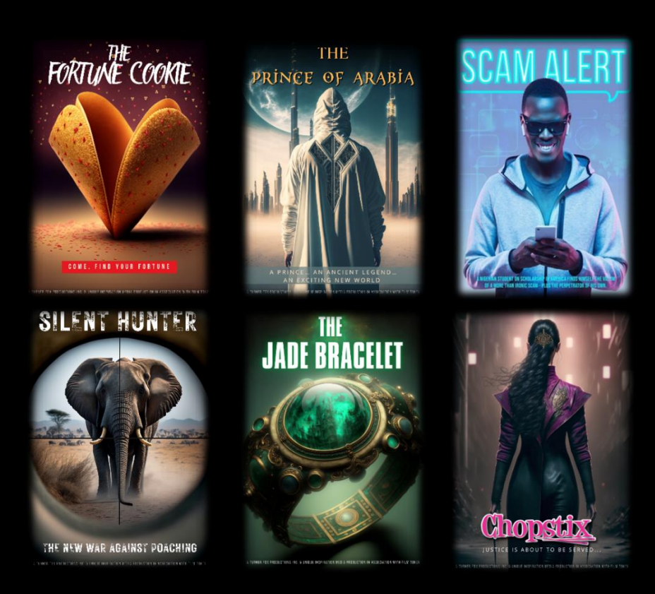
Film Token Launch Portfolio

The FILM Token platform will be launching with a slate of films that have global appeal, are multi-genre and truly diverse.